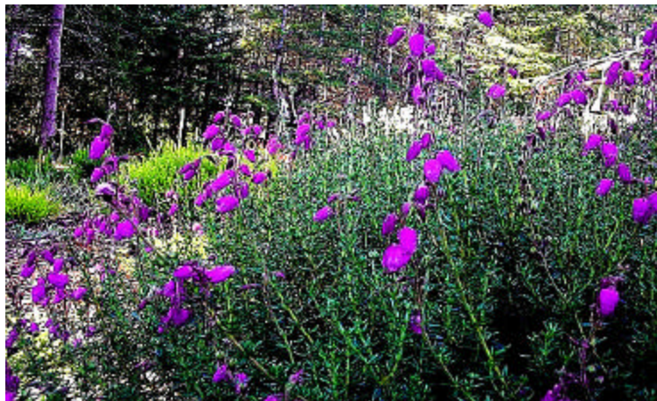
Daboecia cantabrica 'Atropurpurea' seedling. This vigorous plant needs a true and proper name. Perhaps a project for a CHS Meeting?