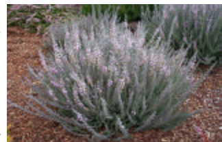
Calluna vulgaris 'Silver Knight'

'Silver Cloud', 'Grey Carpet', 'Jan Dekker' are a few that are quite attractive. 'Sister Anne' and 'Dainty Bess' are a bit more green.