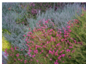
Silver foliage in Thompson's Garden Manchester, CA

A special favorite of mine is 'Pink Pepper'. This delightful dwarf grows to 6" x 12" with tiny branches that are gray green sprinkled with white. It has small pink flowers to match.