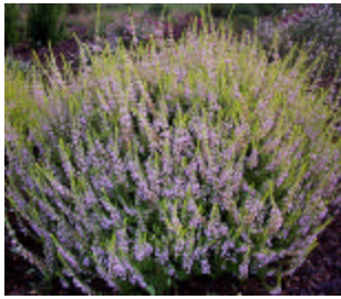
Erica x griffithsii 'Valerie Griffiths'