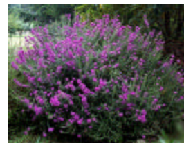
Erica cinerea 'Purple Beauty'