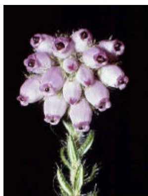
Erica tetralix 'George Fraser'

Some others silvers are 'Kerstin', 'Angela Wain', 'Glendoick Silver', 'Coby', 'Elly', 'Grijsje', 'Yvette's Silver', 'White Knight', 'Silver Stream', 'Oxshott Common', 'Dart's Squirrel', 'Beoley Silver' and 'Pewter Plate'. I am sure I have left out some of your favorites—it was a quick trip through the garden. Most of this group has lavender or mauve flowers. 'Beoley Silver' reminds me of lumpy, velvety yarn. Some years, the silvers are harder to root. They did well with our warm, dry winter this year. Don't get stuck on just 'Silver Knight' and 'Silver Queen' with so many other great choices.